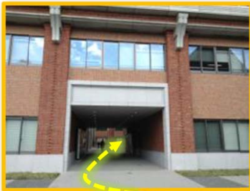
Arch-shaped Entrance of Ryoshinkan building