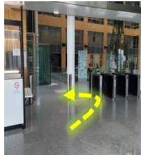
Inside, turn left to the Building A.