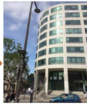
Entrance to the building.