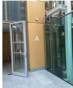
The venue is on the 6 th floor of Building A.