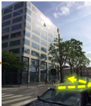
The building of EHESS is in front of Quai de la Gare.