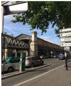
Nearest subway station to the venue, Quai de la Gare.

Address: 190 avenue de France, 75013 Paris, France Website: http://ffj.ehess.fr/